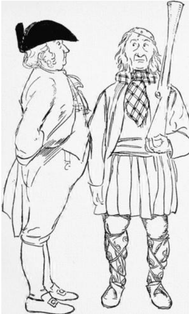
Standing Sentry Over Him

"Now, Mayor," said the captain, "choose. Help me to my Bride, or be bombarded."