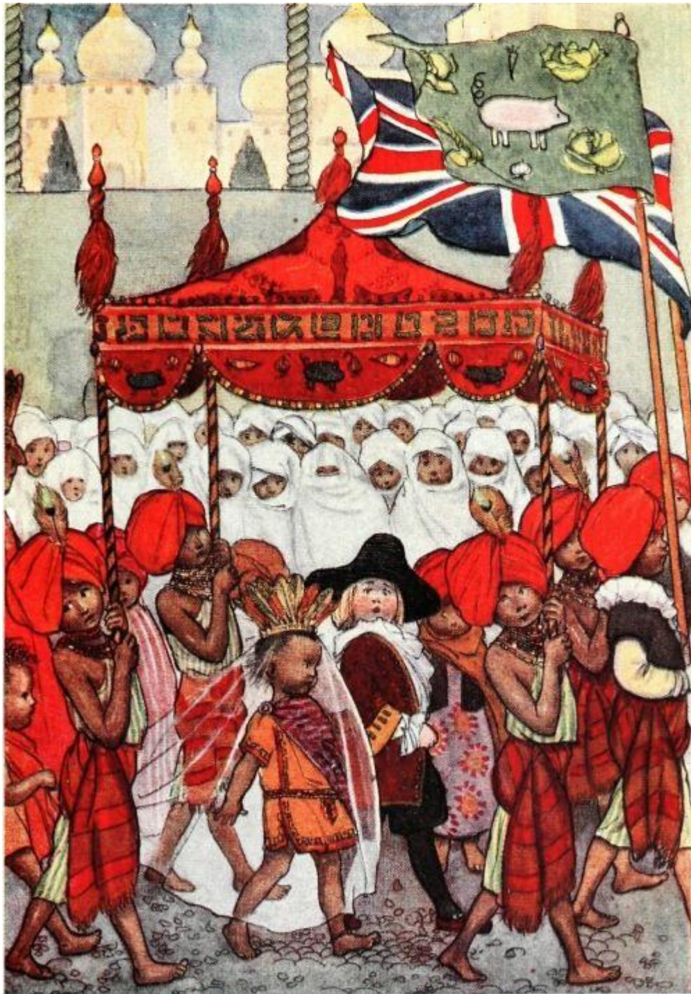
"Married the Chief's daughter"