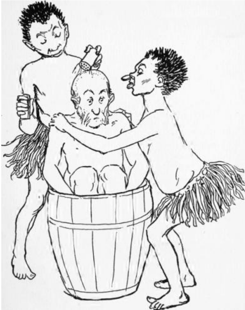
"Two Savages Floured

attend him completely armed. And well were it for other commanders if their precautions—but let us not anticipate.