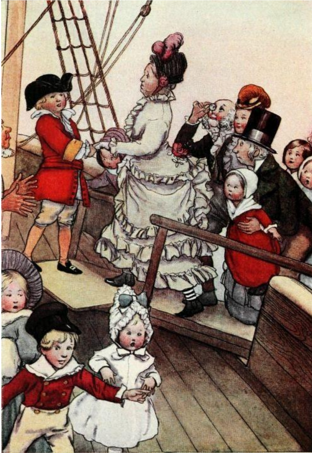
"Invited them to Breakfast"