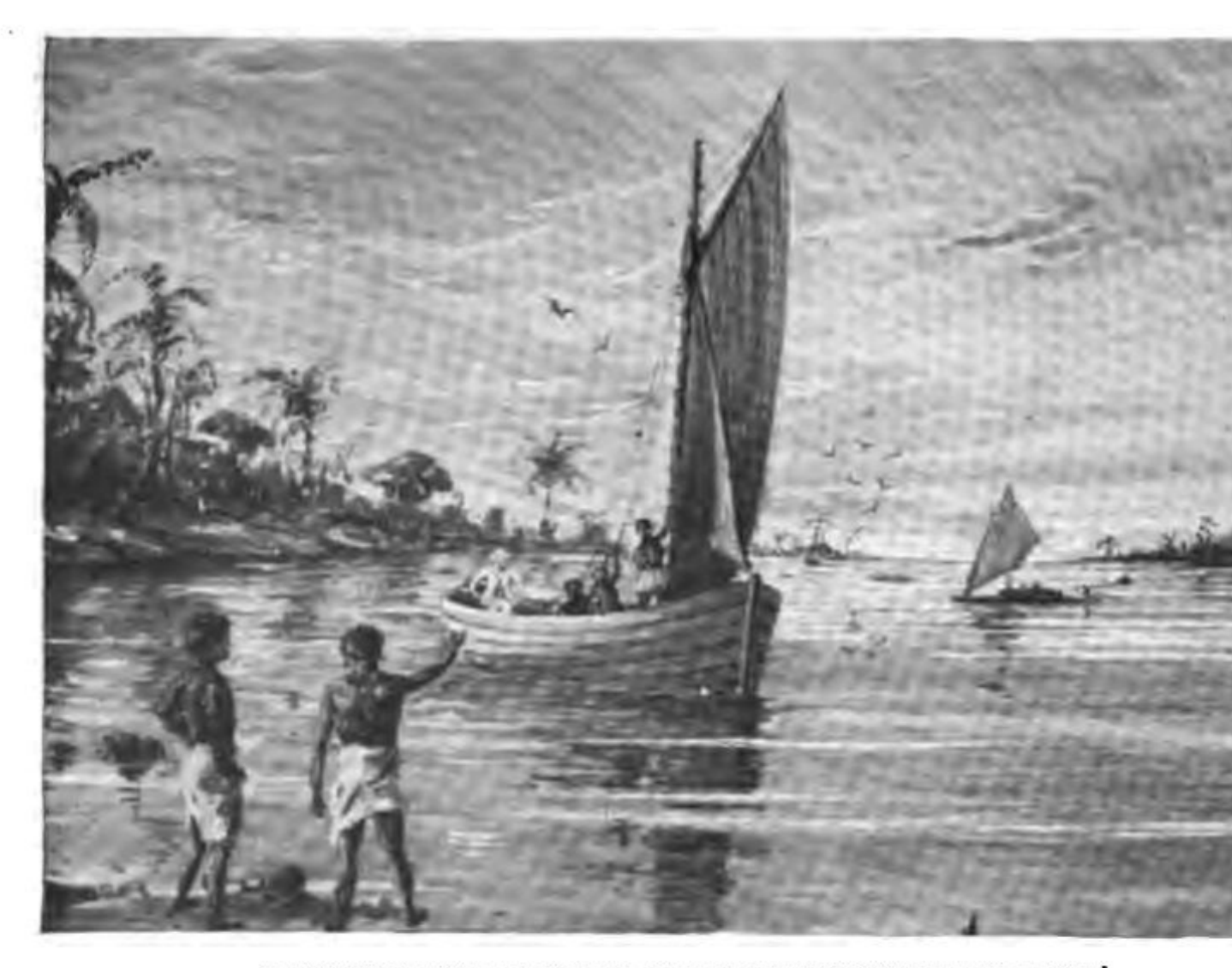
I SAILED DOWN THE LAGOON TO HIS STATION IN MY WHALEBOAT.'