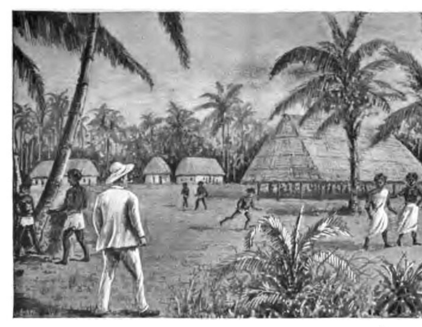
I DIRECTED MY STEPS TOWARDS THE GREAT OPEN-SIDED "MONIEP."