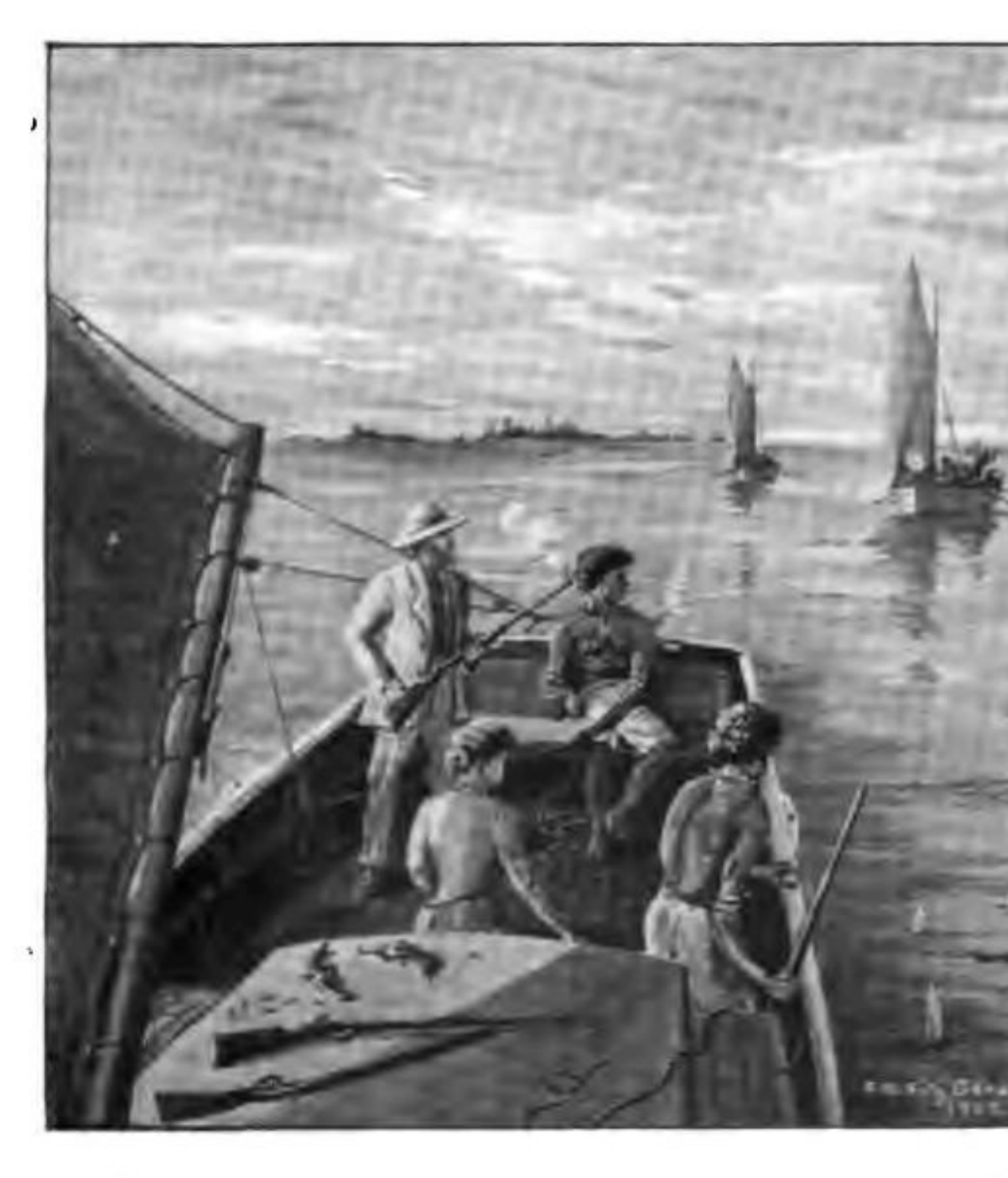
I WAITED UNTIL MY HAND WAS A BIT STEADY, AND THEN DOWN WENT HEADLONG AMONGST HIS CREW.