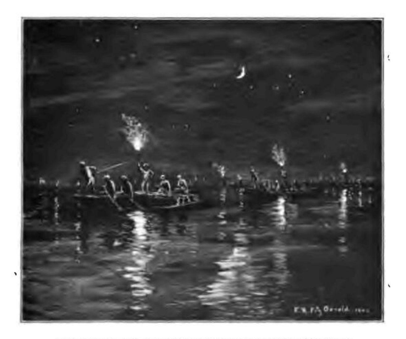
THE CANOES WE HAD LEFT BEHIND US HAD BEGUN THEIR FLYING-FISH CATCHING. [To face p. 80.

The canoes we had left behind us had begun their flying-fish catching, and a long line of brightly burning, isolated flames was lighting up the sea all around, revealing the dark bodies of the fishers, with four paddles sending each canoe through the water, while in the bows stood a fifth, sweeping the water deftly with a scoop net attached to a pole twelve feet in length, his movements guided by a huge torch or flare of dried coco-nut leaves, held aloft by a naked boy standing on the canoe platform amidships. It was indeed a pretty sight, for at times the long line of fires would make a graceful sweeping curve, and then almost unite in a circle, then again open out with a fan-like movement, and advance once more. We watched the fleet astern a little while, and then found ourselves in the midst of the one we had seen ahead. There were over fifty canoes, all manned by Taritai people. They hailed us vociferously, wished us good luck, and as we sailed through their blazing lines of fire they threw so many flying-fish on board that not only