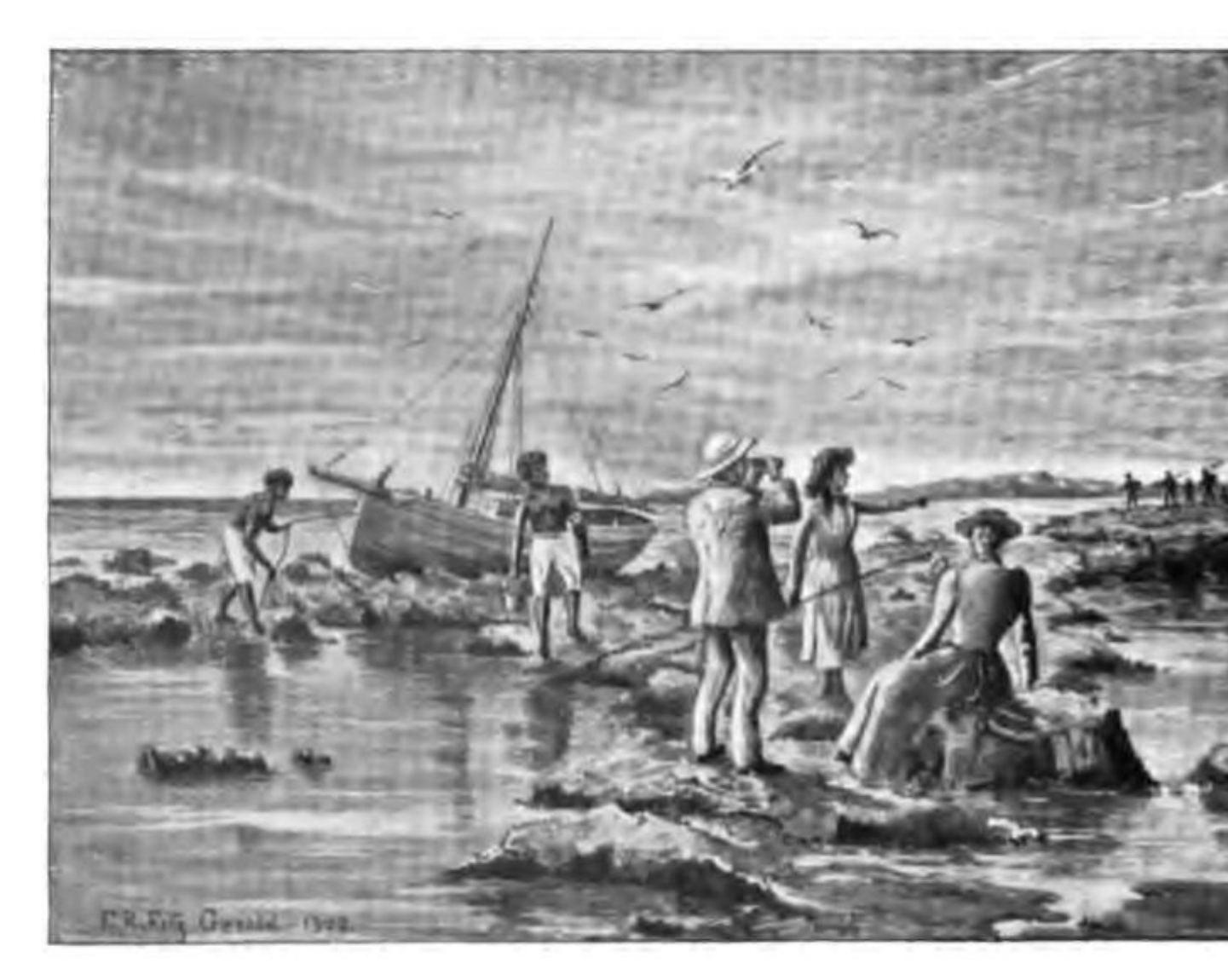
THROUGH MY GLASSES I SAW THEY WERE CARRYING NETS AND FISH BASKETS.

I was considering what was best to be done—the whole five of us could not even move so heavy a boat an inch—when to my disgust the rain suddenly cleared, and I saw that we were aground on Entrance Island, with a native village staring us in our faces less than a quarter of a mile away! And almost at the same moment we saw ten or a dozen men walking over the reef towards us. Through my glasses I saw that they were carrying nets and fish baskets, and I felt relieved at once; the moment they saw us they dropped their burdens and came on at a run. None of them were armed.