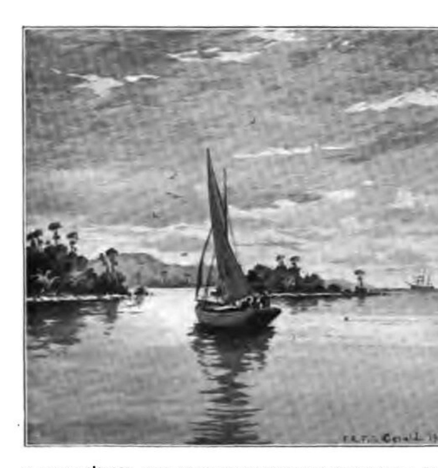
AT SEVEN O'CLOCK, JUST AS WE WERE ENTERING IT, WE SAW A BALYING ON THE REEF ABOUT HALF A MILE AWAY TO THE NORTHWA