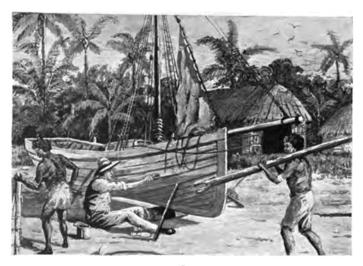
THEN I GAVE HER TWO GOOD COATINGS OF RED LEAD FROM KEEL TO ABOVE WATER LINE, AND. ABOVE THAT, PAINTED HER WHITE. [To face p. 74]