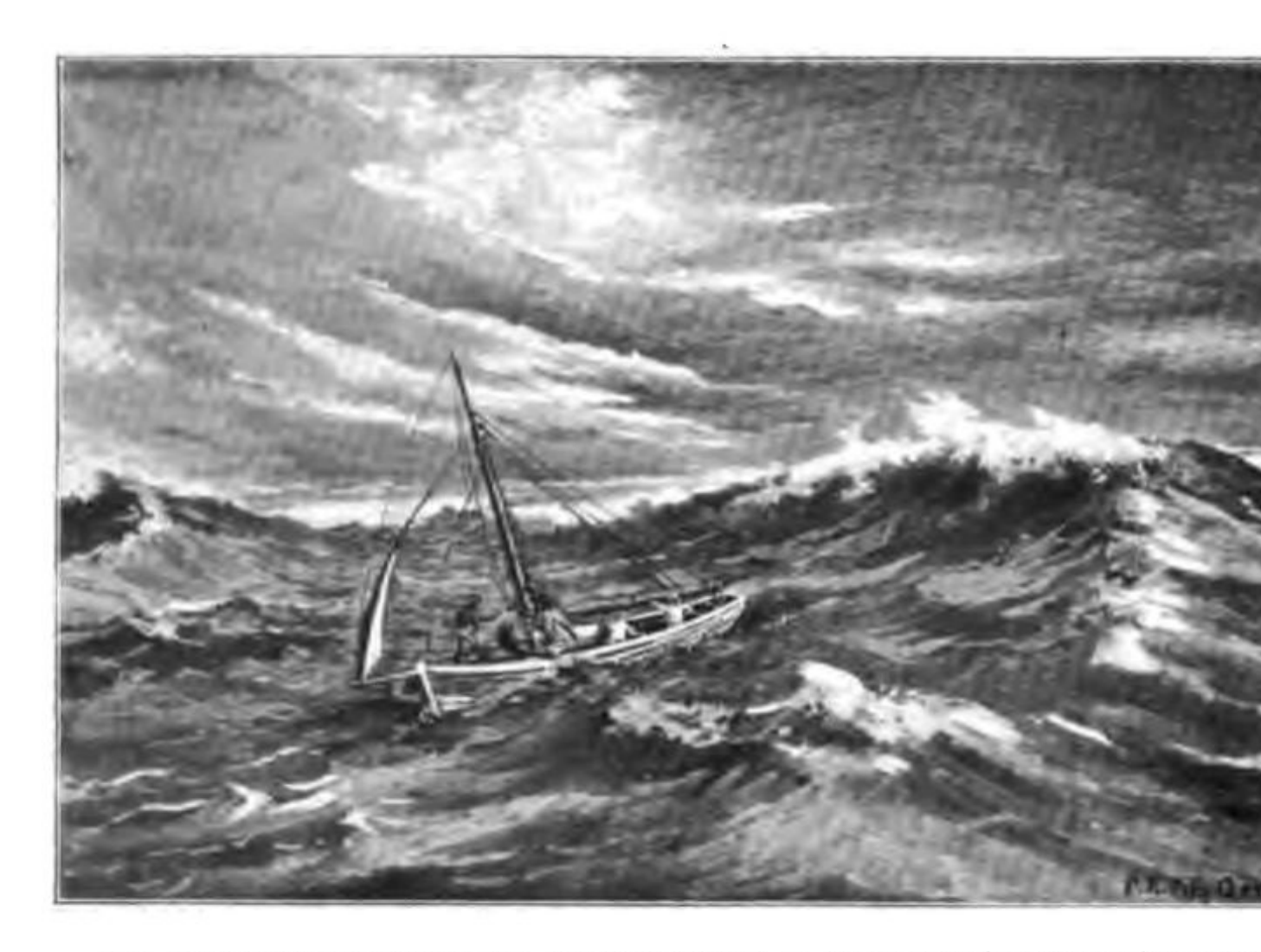
HOW WE ESCAPED BROACHING TO AND FOUNDERING IN THAT WILD GALE WILL ALWAYS E WONDER TO ME.

How we escaped broaching to and foundering in that wild gale will always be a wonder to me, for the boat, although she did not ship much water, seemed so deadly sluggish at times that looking astern made my flesh creep. All that night we went tearing along, and glad enough we were when day broke, and we saw the sun rise. The wind still blew with great violence, but later on in the morning the sky cleared rapidly, and at nine o'clock, to our delight, we sighted Apamama a little to leeward, distant about eight miles, and in another hour we raced through the north passage and brought-to in smooth water under the lee of two small uninhabited islands which gave us good shelter. From where we were anchored we could see the main village, which was six miles away to the eastward, and I quite expected to see visitors coming as soon as the wind fell sufficiently to permit of boats or canoes beating over to us, and determined to give them the slip if possible, and get under way again before they could board us and urge me to come and anchor on the other side, abreast of the village.