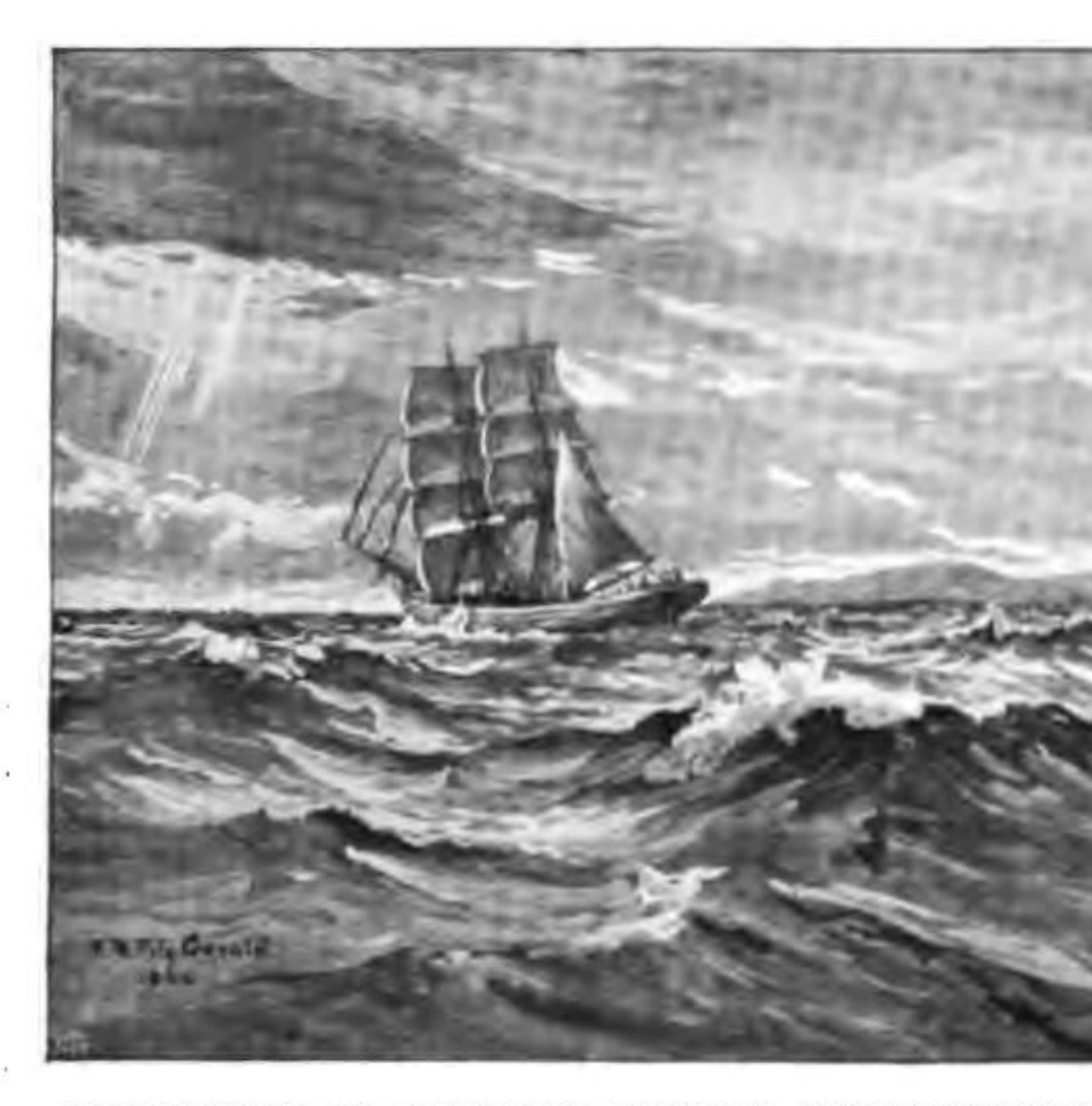
WITH FORTY OF HIS STURDY LINE ISLANDERS, AND SEVEN HUNDRED BARRELS OF COCO-NUT OIL, HE HAD SAILED.