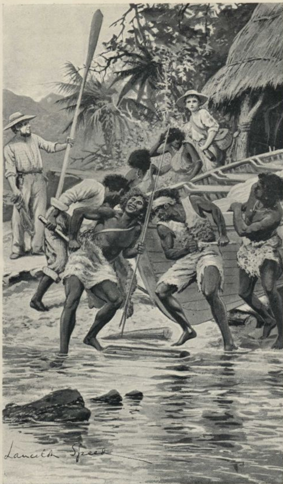
THE BOAT WAS SOON RUN OUT OF THE DARK SHED.