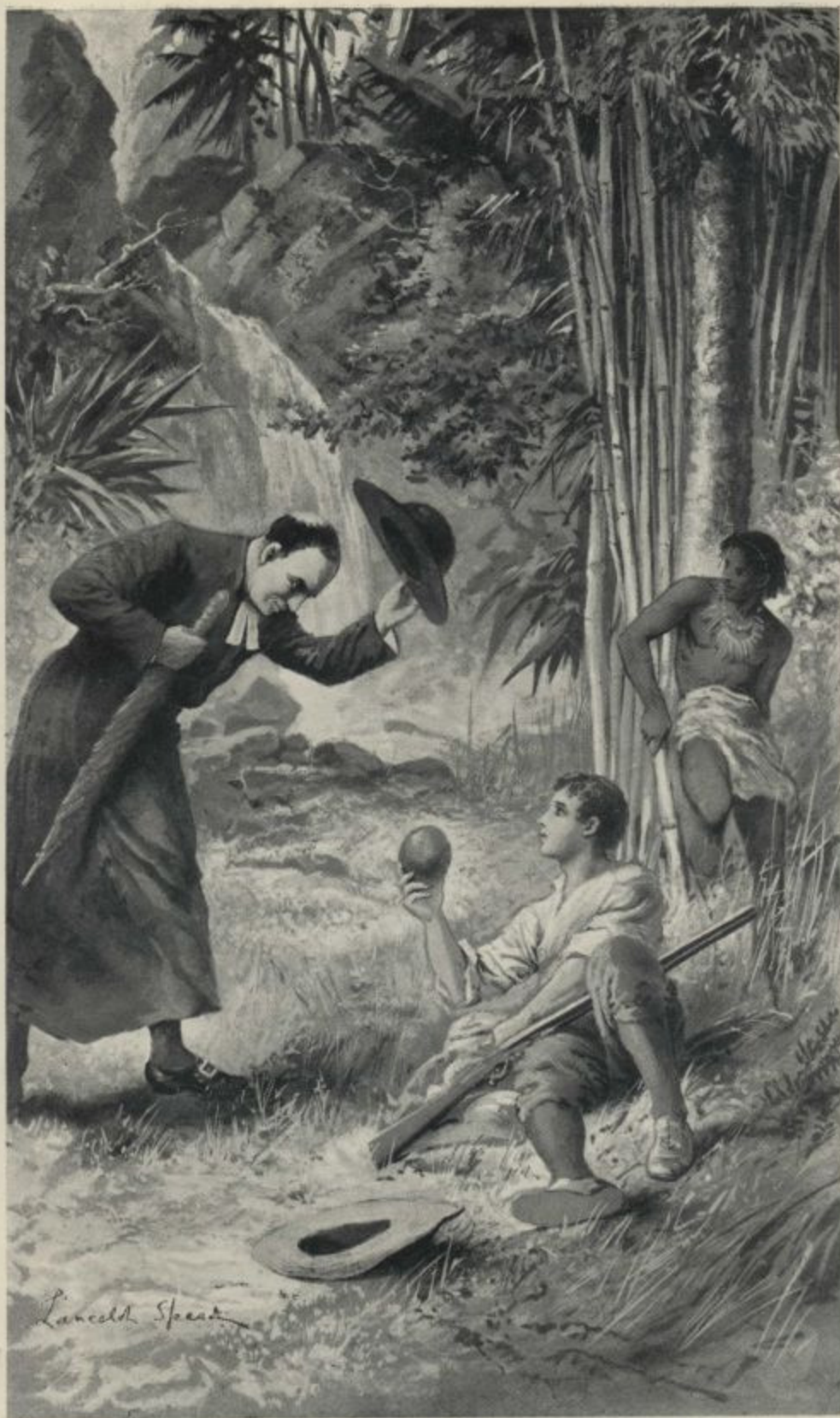
LOOKING UP, HE SAW A MAN DRESSED IN THE HABIT OF A PRIEST.