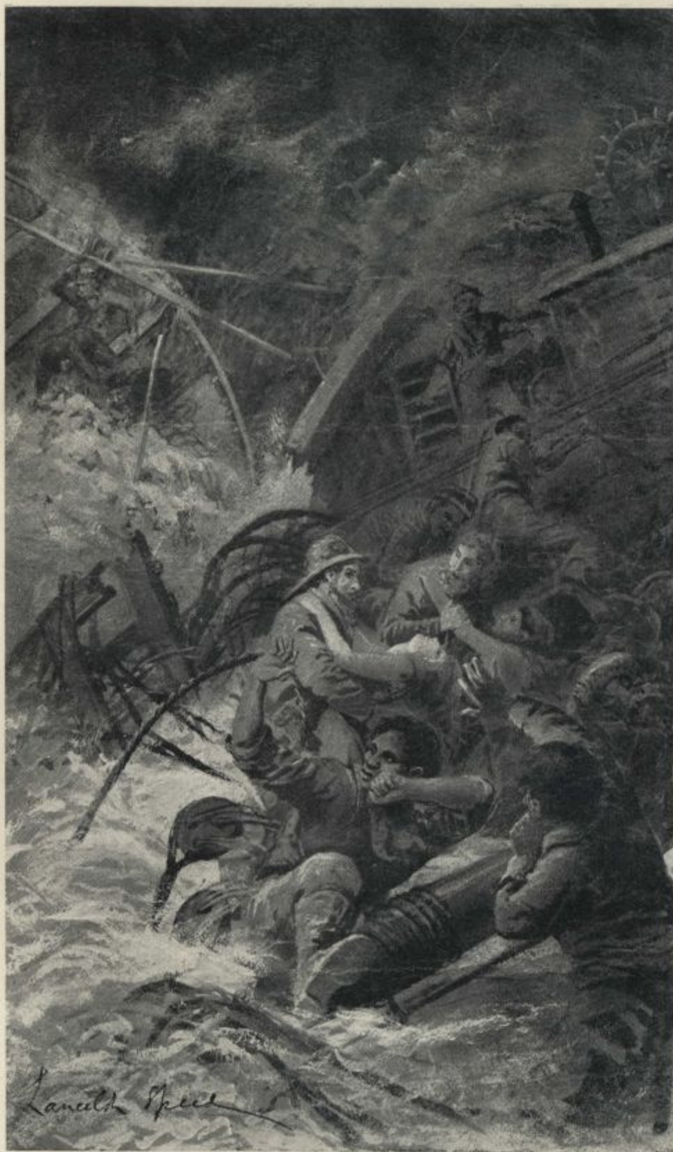
THE SHIP GAVE A SUDDEN ROLL AND CRASHED OVER HER BILGE.