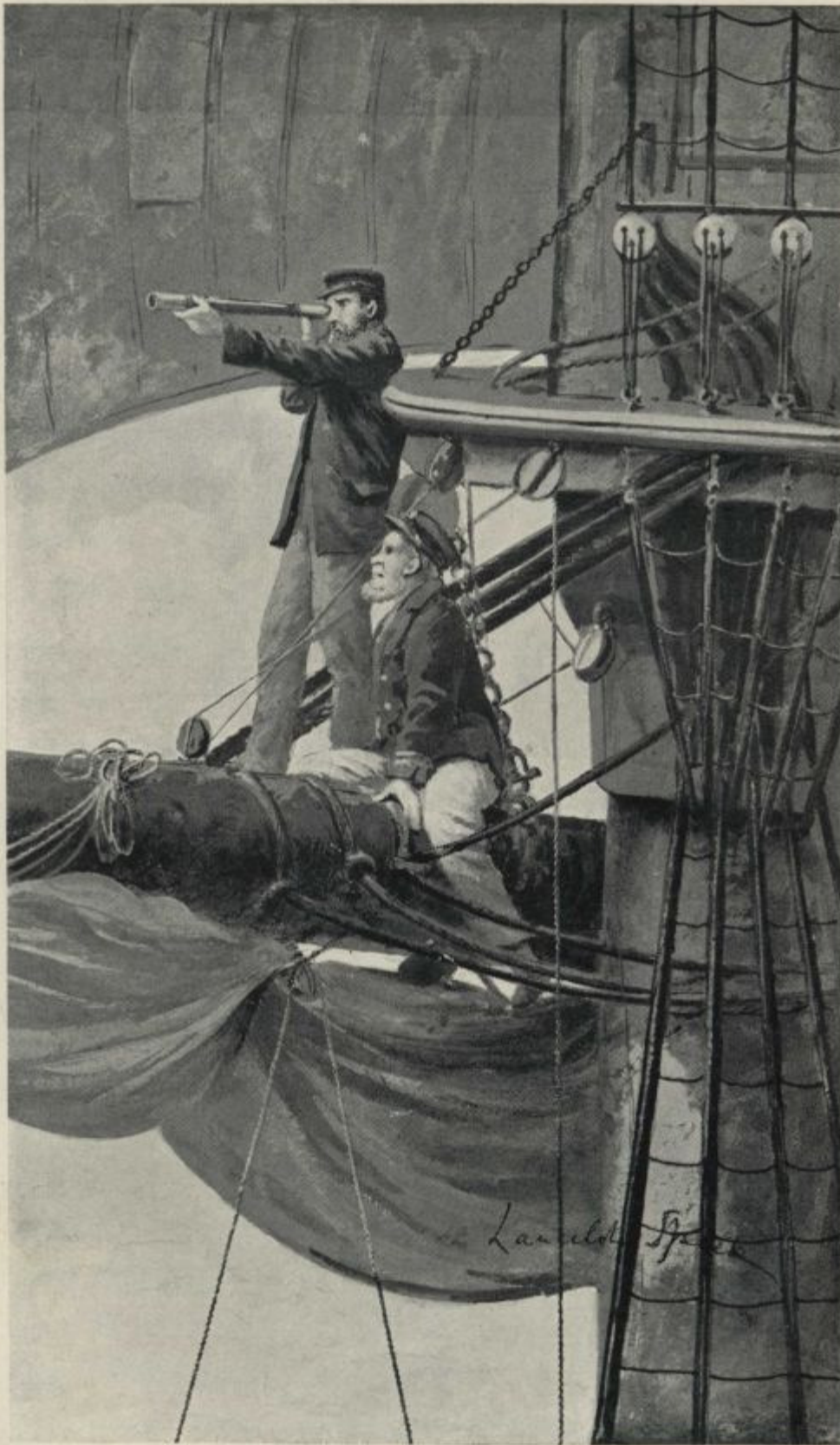
OLD SAM CLAMBERED UP TO THE FORE-YARD BESIDE HIS MATE.