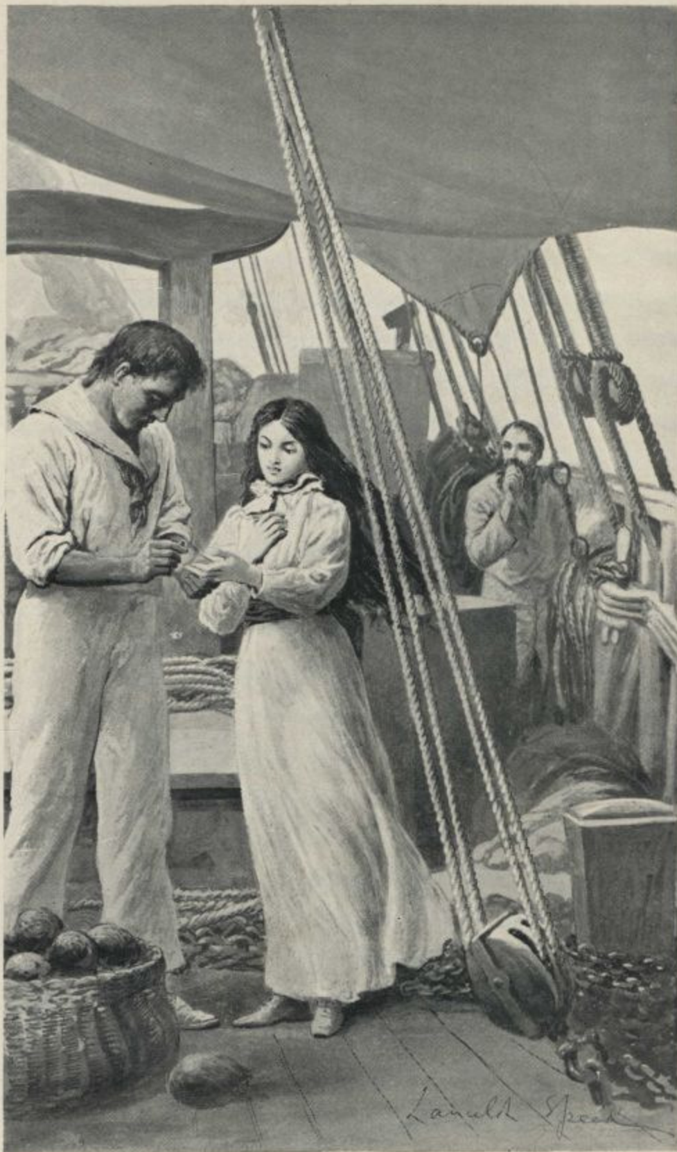
HE TOOK A SILVER RING OFF HIS LITTLE FINGER.