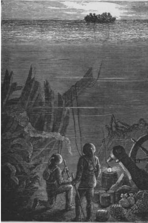
AT THE BOTTOM OF THE SEA.—PAGE 199.

lay in their way. Some of the gold had been washed out of the treasure-room in their absence, and was not easily recovered from the sand and sea-weed. In order the better to find this, the electric-lamp was brought into requisition and found to be most effective, its light being very powerful—equal to that of fifteen thousand candles,—and so arranged as to direct the light in four directions, one of these being towards the bottom by means of a reflecting prism. It burned without air, and when at the bottom, could be lighted or extinguished from the boat by means of electricity.