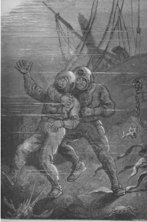
CAUGHT NAPPING.—PAGE 95.