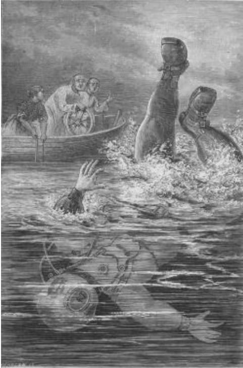
ROONEY BLOWN UP BY HIS WIFE.— Frontispiece. —Page 124.

She ended with a wild shriek, for at that moment the